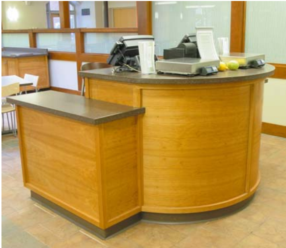
Cashier station at Mt. Holyoke College, South Hadley, MA, by Refcon and Ricca Newmark Design

Refcon is proud to undertake the extra work and expense of separately storing and specially handling FSC-certified woods, and to opening our facilities to periodic inspections by personnel from the Forest Stewardship Council-approved Scientific Certification Systems.