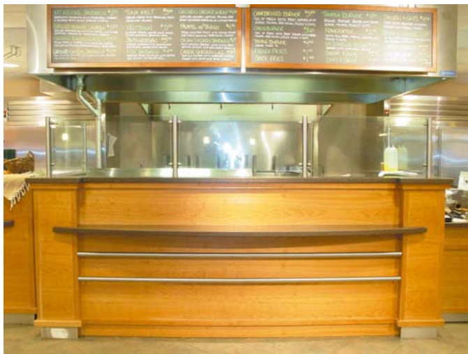
Serving station at Mt. Holyoke College, South Hadley, MA, by Refcon and Ricca Newmark Design

In fact, Refcon is now the exclusive large-scale producer of refrigerated fixtures and counters containing only woods certified by the global Forest Stewardship Council (FSC) and no environmentally destructive glues or solvents.