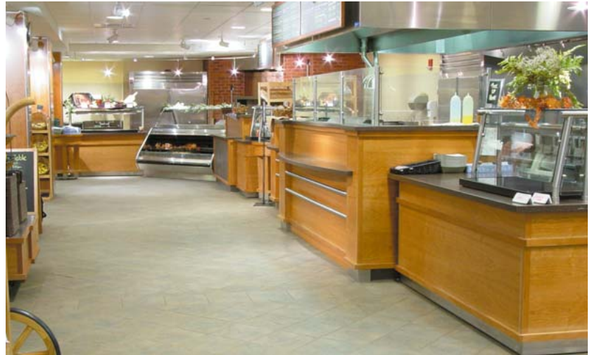
Servery at Mt. Holyoke College, South Hadley, MA, by Refcon & Ricca Newmark Design

This commitment reflects Refcon's support of renewable practices throughout the foodservice industry. It also demonstrates our ability to manufacture precisely the sorts of products our business partners require in an environmentally friendly manner. If this sounds like the sort of company you want to do business with, remember –